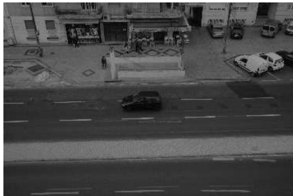
Fig. 3. Low-light scenes lead to video sequences with very low contrast between moving objects and background.