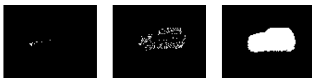
Fig. 4. Three stages of the relaxation process for the video sequence illustrated in Fig. 3. The final estimate of the moving object template is on the rightmost image.