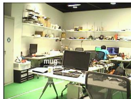
Figure 2: Detection of a previously identified object (mug).

Figure 1 shows the telepresence interface (left) and the operation of tagging an image region and associating it with the tag string “mug” (right). Then, whenever the robot identifies in the image features whose descriptors match an object in the database, a rectangle is drawn surrounding the features, together with the associated tag. This is shown in Figure 2.