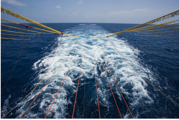
Fig. 1. Ship towed methodology for geotechnical surveying.

mission planning issues to be faced in the project. Section VI addresses the communication activities within the project and Section VII briefly accounts for the necessary system integration and experimentation activities. Finally Section VIII reports concluding remarks.