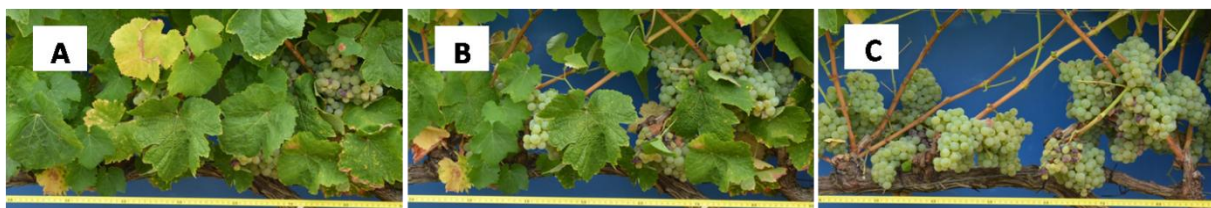
Figure 1. Images collected between defoliation steps on the variety Encruzado . A) non-defoliated vine. B) half-defoliated vine. C) fully-defoliated vine.

Images of non-defoliated vines were collected. Out of these images, canopy gaps and bunches' region of interest (ROI) files were computed in order to estimate the projected area of these parameters. Grapevines were then defoliated, at fruiting zone, in two steps in order to create different canopy porosity levels. First, half the leaves were taken off (half defoliation) then, the remaining ones (full defoliation). Between each defoliation moment new images were obtained using the same methodology described above. Images were collected close to 11:00 a.m. from the eastern side of the canopy.